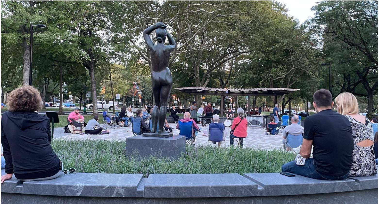
The Parkway Council runs Music in Maja Park in the Spring & Fall. Other events may happen on the paved courtyard throughout the year as well.