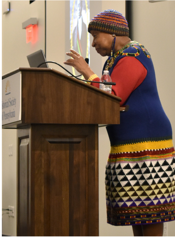
Xenobia Bailey: Artist Talk at HSP as part of HSP's 200th Anniversary celebration and the raising of The Radical Black Elite banners.

The aPA took part in (re)FOCUS , a citywide exhibition in 2024 that honored the 50th anniversary of the original FOCUS festival at Moore College of Art and Design in 1974. The aPA's offering, (Re)FOCUS on Women in Public Art , was a self-guided tour.