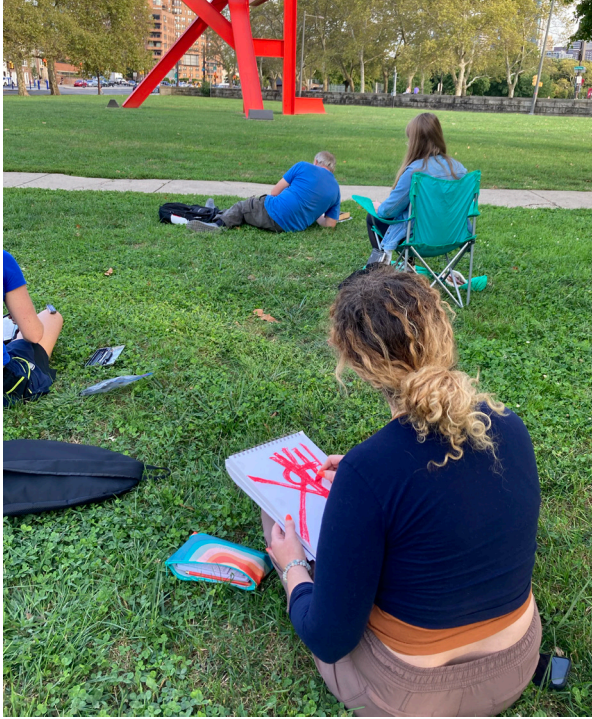
Drawing Public Art workshop in partnership with Fleisher Art Memorial. On site at Iroquois .