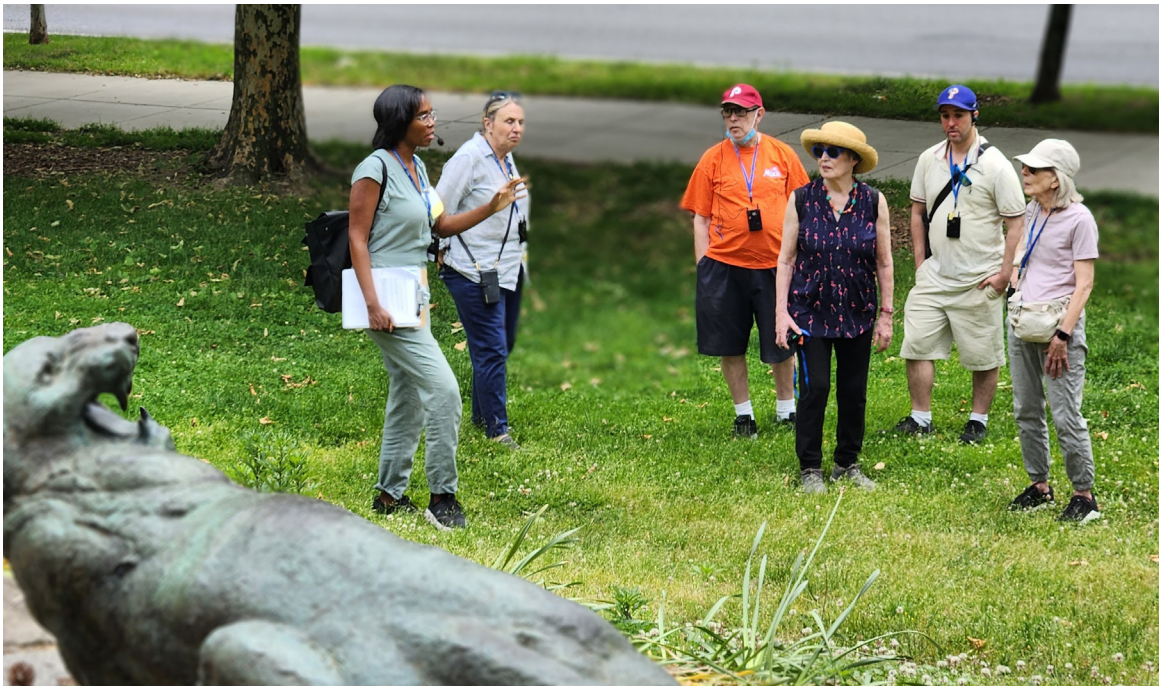
Public Art, Landmarks, and Transformations Along the Schuylkill and Historic Rittenhouse Square walking tours in partnership with HSP and the Preservation Alliance.