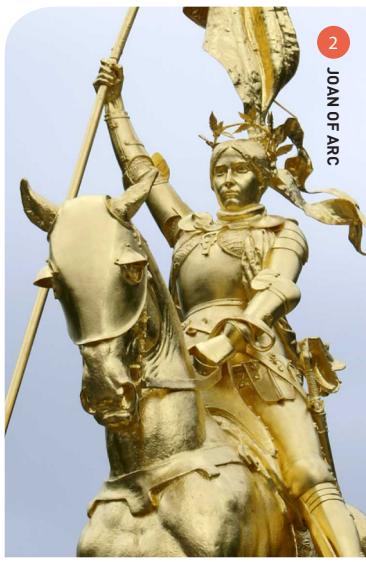
2 JOAN OF ARC