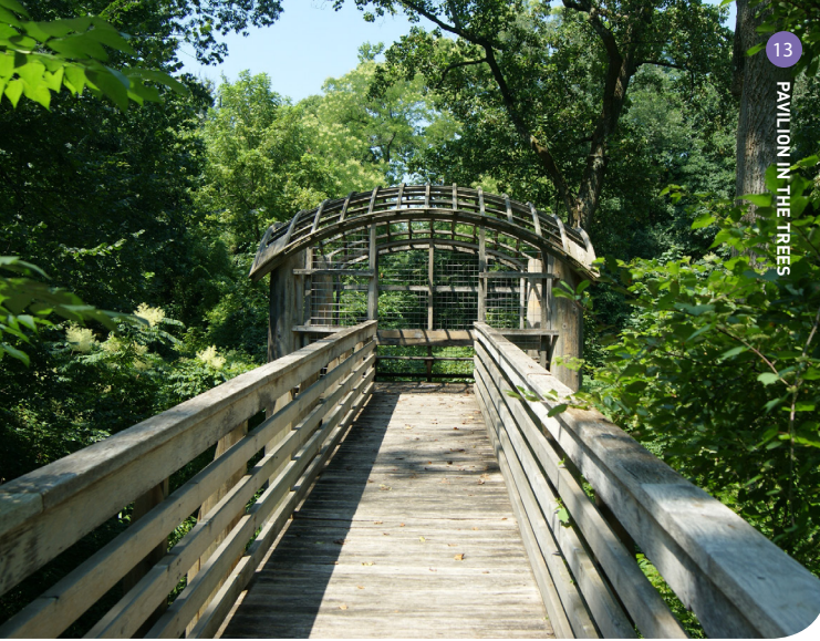
13 PAVILION IN THE TREES