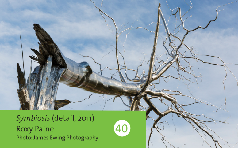
Symbiosis (detail, 2011)