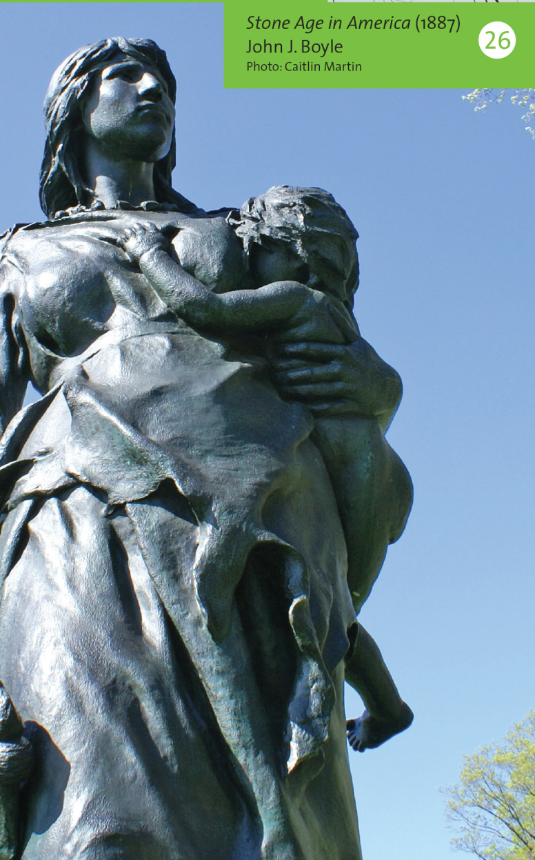
Stone Age in America (1887)